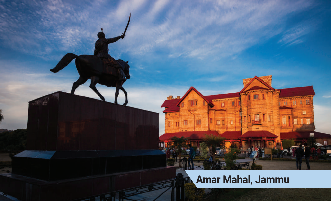
Amar Mahal, Jammu