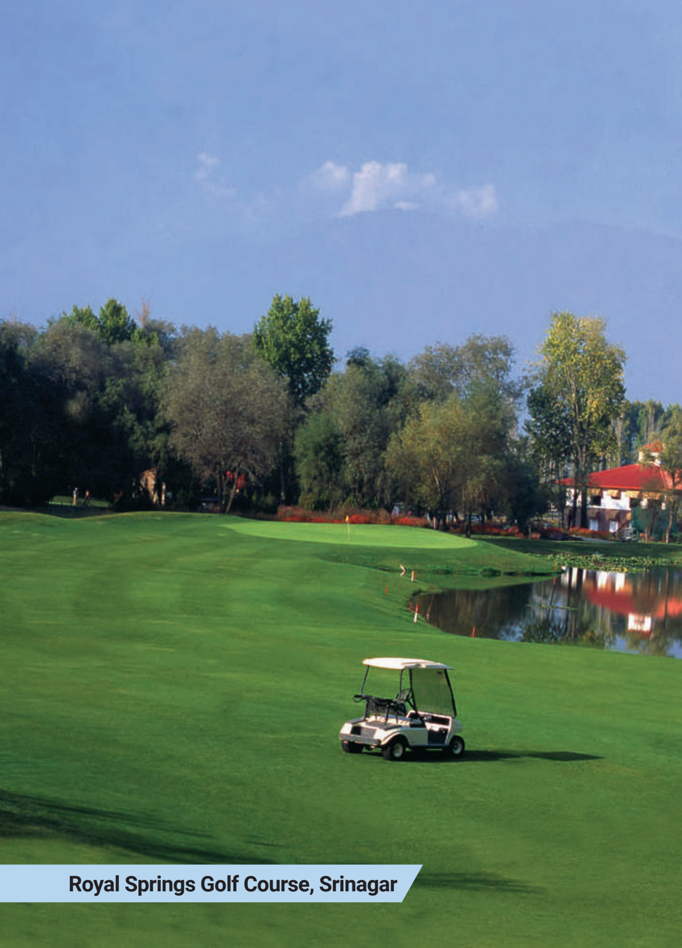
Royal Springs Golf Course, Srinagar