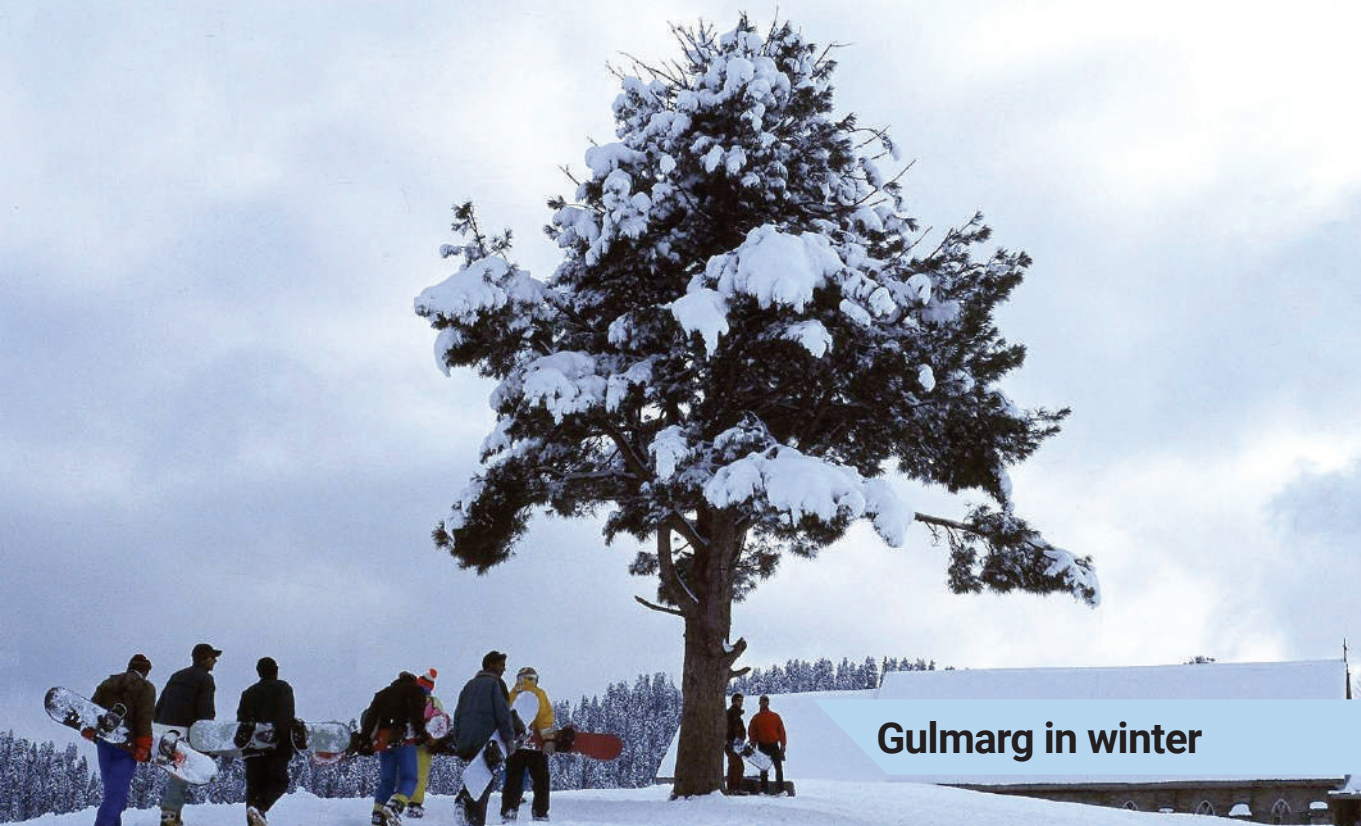
Gulmarg in winter

financial intervention and provide a mechanism for disbursement of fiscal and non- fiscal incentives.