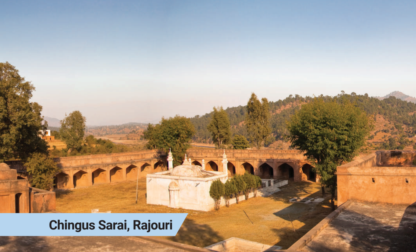
Chingus Sarai, Rajouri