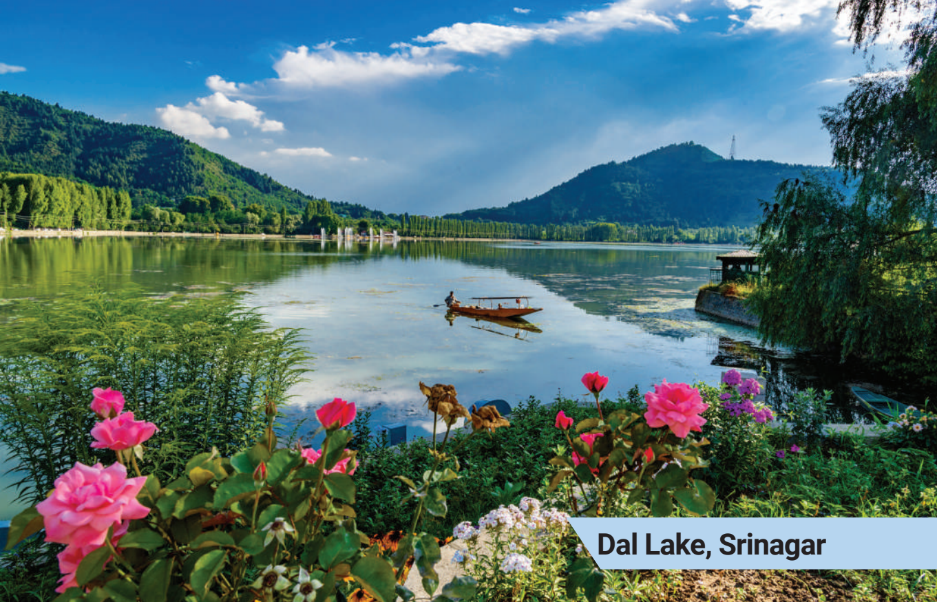
Dal Lake, Srinagar