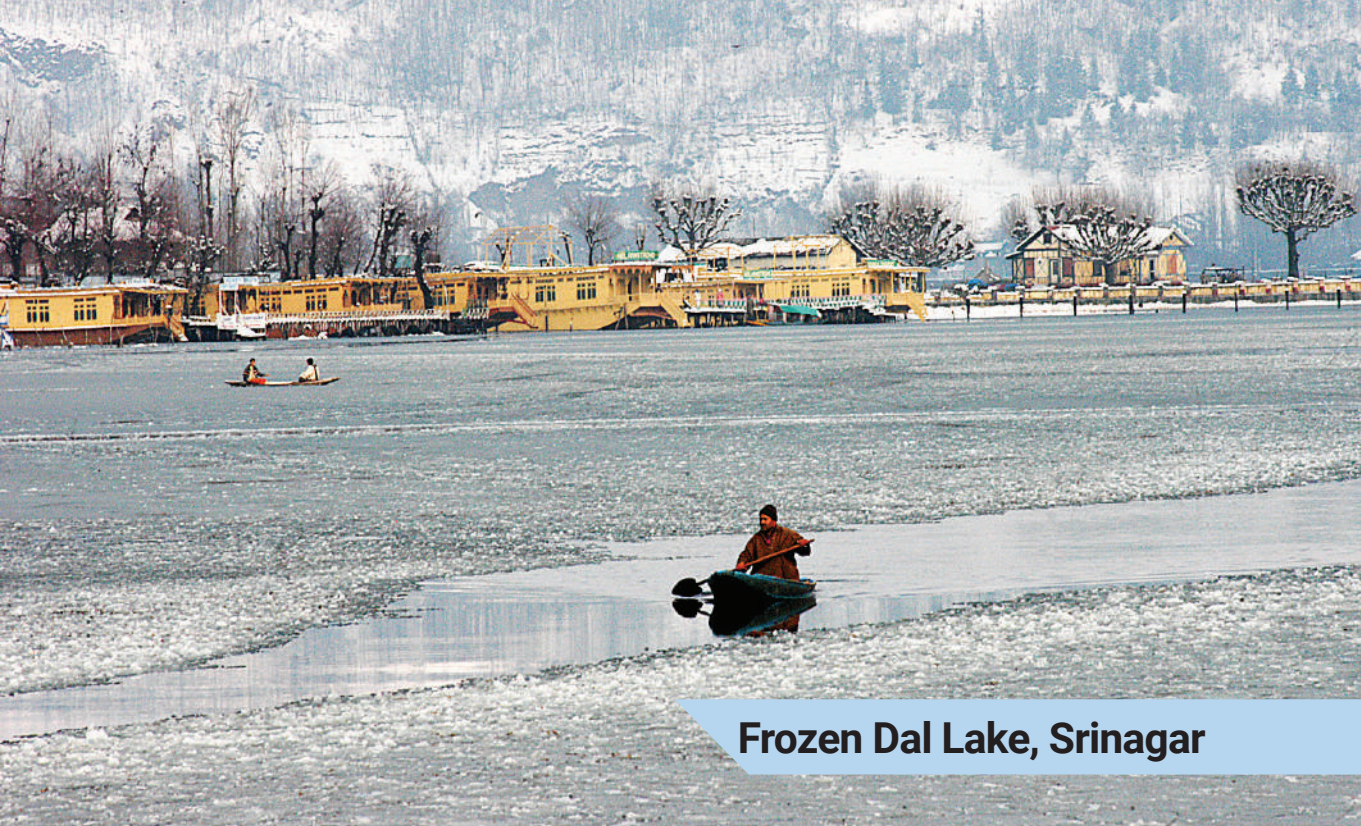
Frozen Dal Lake, Srinagar