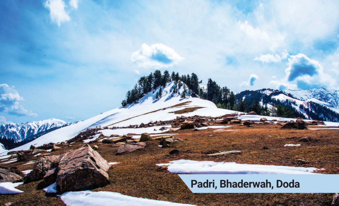
Padri, Bhaderwah, Doda

industry. Hon'ble LG visited Mumbai to meet the film fraternity and seek their suggestions for reviving the film ecosystem in the UT of J&K. Based on the suggestions received from the film fraternity as well as after studying the film policies of several State in India, a holistic Film Policy - J&K Film Policy 2021, has been formulated to attract greater investment in the film sector and will make Jammu and Kashmir a choicest destination for film shooting of both national and international film makers