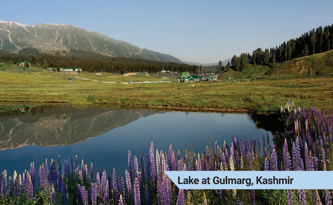
Lake at Gulmarg, Kashmir

Film Policy-2021. It has the authority to make and issue detailed guidelines, rules, checklists and all required formats, agreements etc essential for implementation of the Policy.