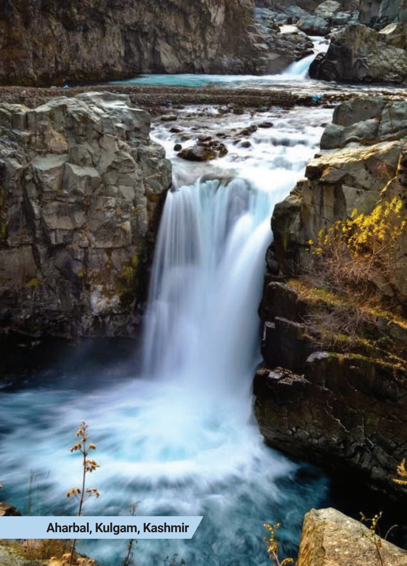
Aharbal, Kulgam, Kashmir