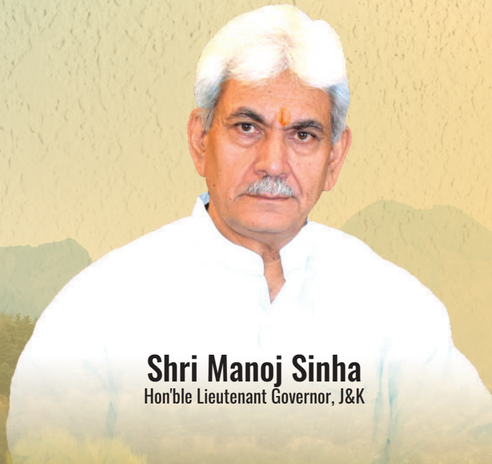
Shri Manoj Sinha Hon'ble Lieutenant Governor, J&K