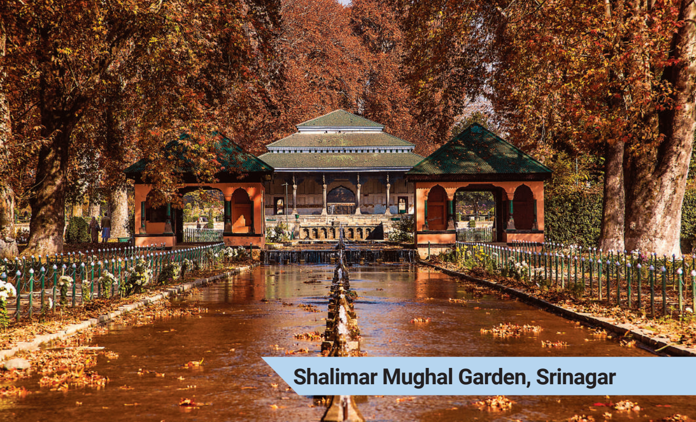
Shalimar Mughal Garden, Srinagar